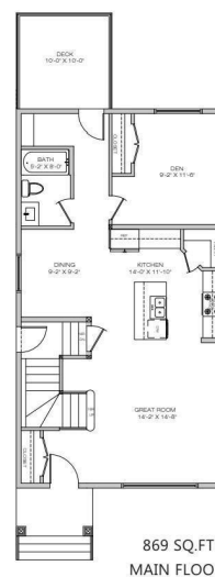
869 SQ.FT. MAIN FLOOR