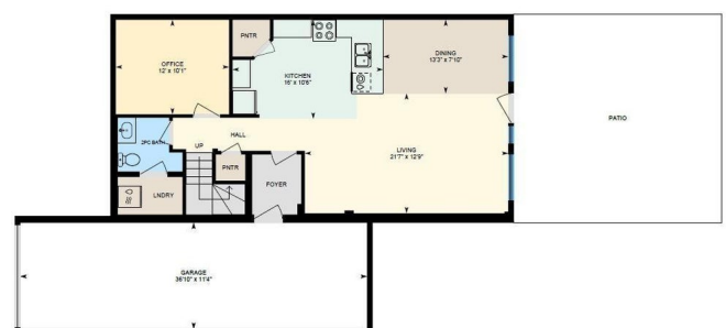
Main Floor Interior Area 856.69 sq ft Excluded Area 415.67 sq ft